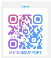
Etere Support Telegram

The Etere team is on standby 24/7 to help you succeed and get the results you need; whether it is troubleshooting an issue or customizing workflows, the Etere support service is always available for all Etere users on a support contract. Furthermore, Etere users have access to unlimited software updates and upgrades, keeping your system optimized for the best performance at all times. As part of its commitment to users, Etere invests in its Research and Development to release new features, upgrades and security patches several times per year, keeping your Etere system optimized at all times.