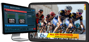
Channel in a box Etere ETX